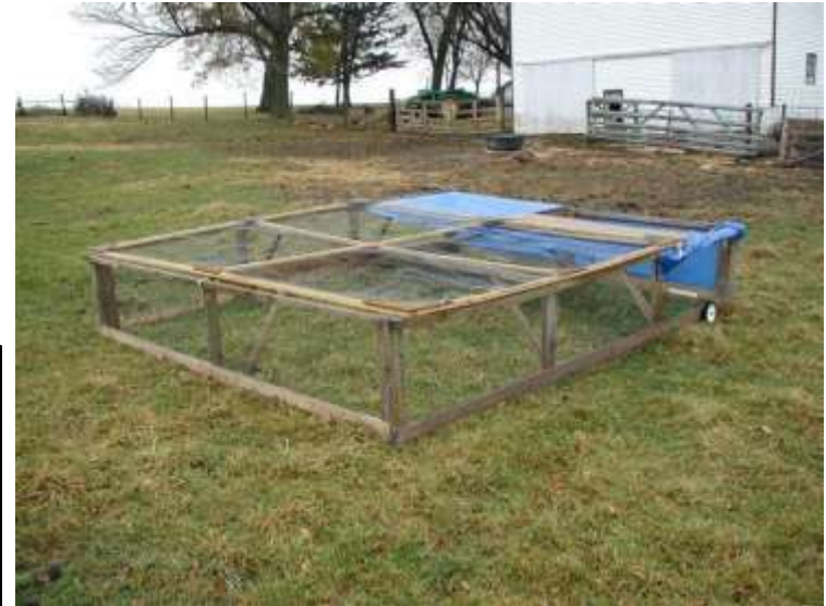
Salatin-style poultry tractor